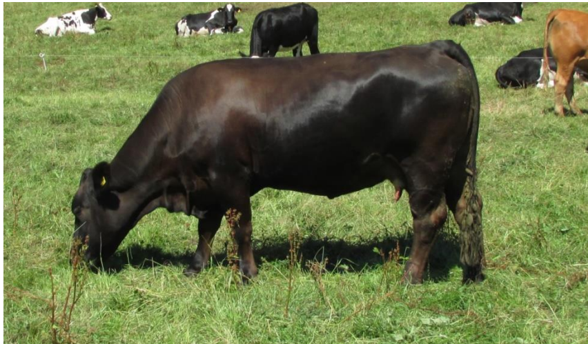
Champion Female 2019 'Stirling Daphne D8' exhibited by Geoff Otterson

Beef Schedule Entries Close Sunday 15 November 2020