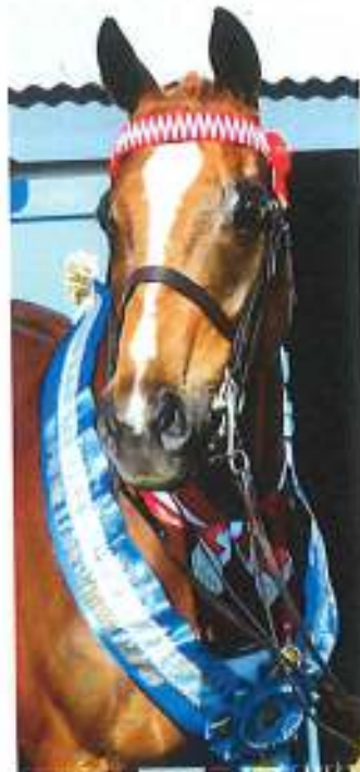
2018 Overall Supreme In Hand Exhibit, Zansipour exhibited by Norling Family